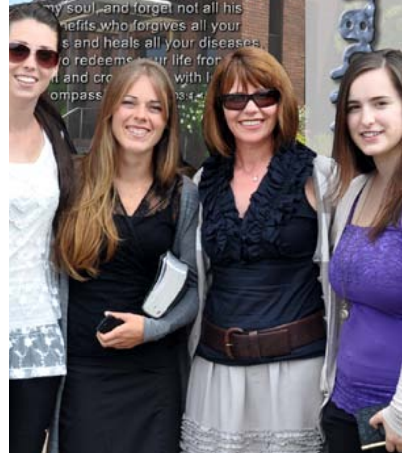
Kršćanska adventistička crkva - St. Albans - Croatian Seventh-day Adventist Church

Praise the LORD, O my soul, all my inmost being, praise his holy name. Praise the LORD, O my soul, and forget not all his benefits who forgives all your sins and heals all your diseases, who redeems our life from death and crowns us with his compassions.