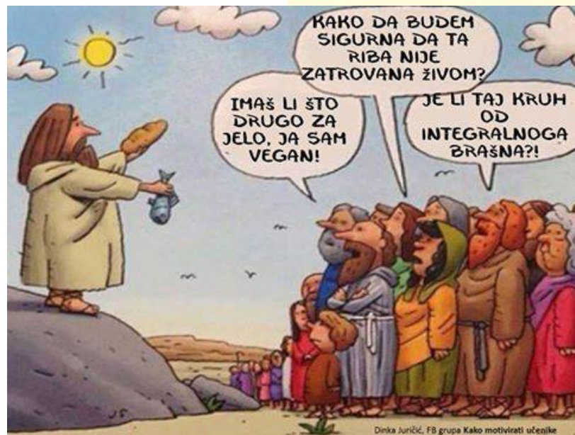
Dinka Juričić, FB grupa Kako motivirati učenike

Vlado Lipković marljivo i uspješno održava zelene površine u crkvenom dvorištu. Njegov je prijedlog da se nađu donatori koji bi omogućili kupnju još jedne klupe